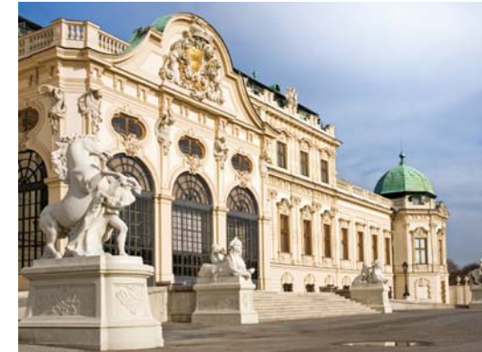
Left: A team of photographers photograph the new speakers at the Contemporary Belvedere Museum in Vienna.