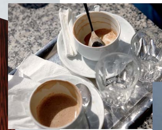
Clockwise: The Secession Building that holds the work of Gustav Klimt—the inspiration for Vienna Acoustics latest speakers, a cup of Viennese coffee served with a glass of water, the Musikverein, and the State Opera house.