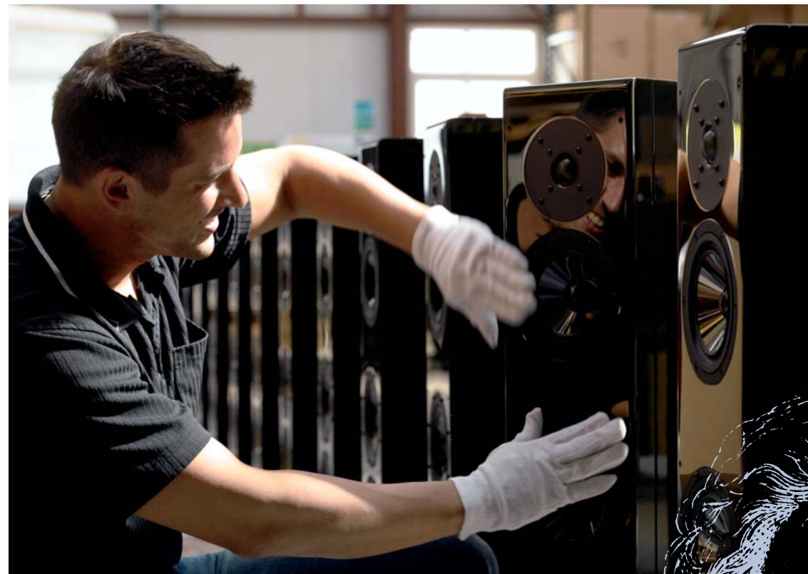
Top: Each speaker pair receives a handwritten serial number—including these Haydn Grand speakers.